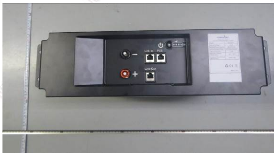
电池正面外观 Battery front appearance