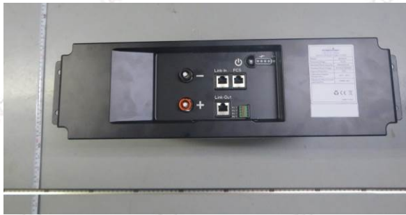
电池正面外观 Battery front appearance