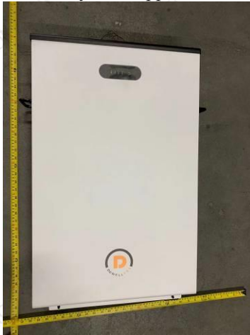
电池正面外观 Battery front appearance